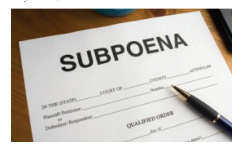
Tip #3 - Comply with the subpoena

There are basically two ways to present objections to a subpoena. First, a South Dakota business can serve a written list of objections within 14 days after receiving the subpoena. Second, a South Dakota business can file a "timely" motion to quash or modify the subpoena.