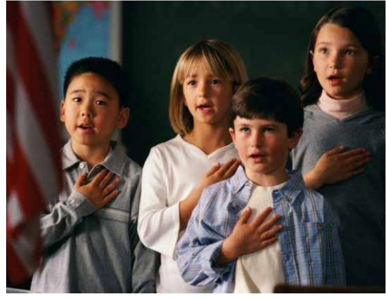
Q: Does a school district have to provide students the opportunity to recite the pledge of allegiance?

A: No. A school board may not impose a lesser consequence than those established in SDCL 13-32-9. However, school board may adopt a policy with more strict consequences to meet the needs of the school district.