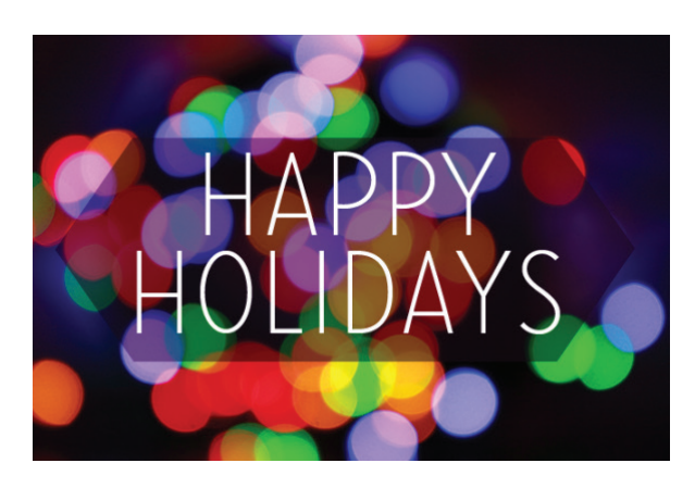
Thank you for all you do for our South Dakota schools! Your hard work for the kids is so appreciated!